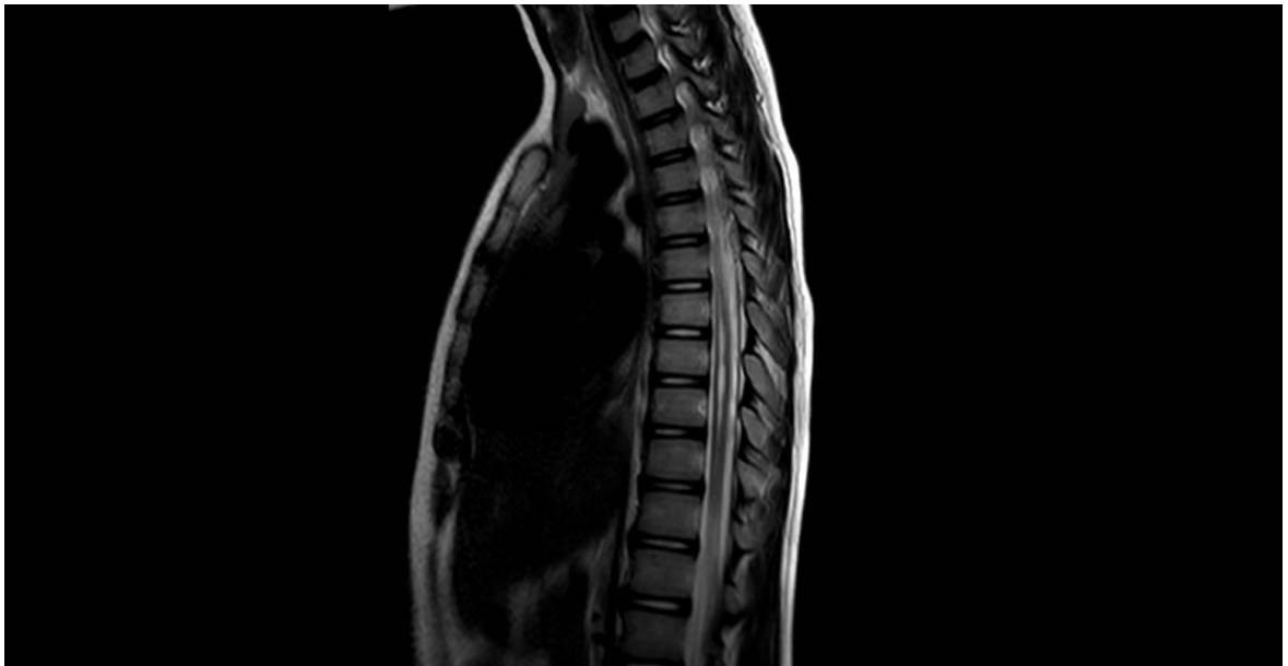
Figure (6): Sagittal T2 MRI sequence at 3 years of follow-up showing mild regression of syringomyelia.