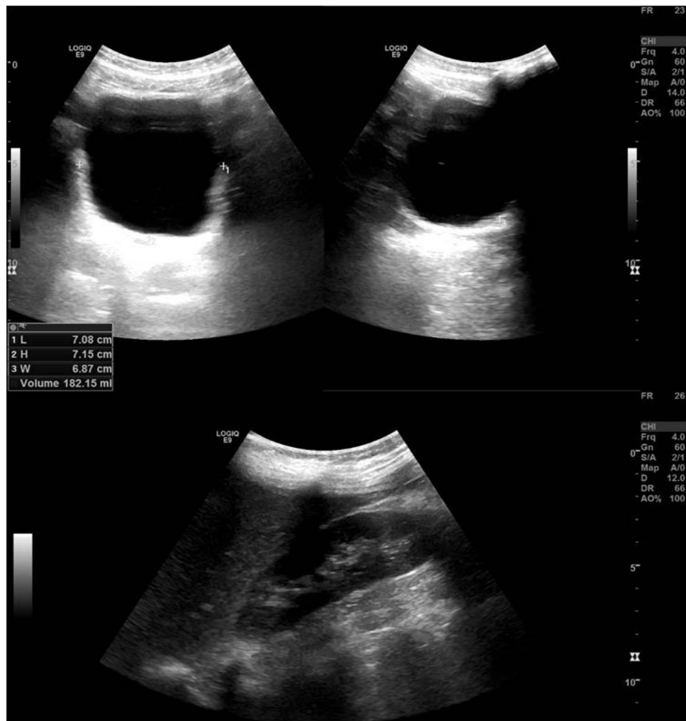
Figure (1): Urinary tract ultrasound showing normal kidneys and urinary bladder at the initial presentation.

A whole-spine MRI revealed a regular lying cord ending at the L1 vertebral body level with no kyphoscoliosis, tethered cord, split cord syndrome, or spinal dysraphism, as well as syringomyelia extending from T4 to T12 and measuring maximally about 2.7mm in anterior-posterior (AP) diameter at the D8D9 level (Figure 3). An MRI of the brain revealed no Chiari malformation or other abnormalities (Figure 4). The patient was started on the maximum dose of oxybutynin without significant improvement. As medical treatment failed, endoscopic injection of 200 international units of OnabotulinumtoxinA was tried with excellent symptomatic relief. During 3 years of follow-up, the Onabotulinumtoxin A injection was repeated twice. Urodynamic testing and radiological follow-up at one and 3 years showed no significant deterioration (Figure 5) (Figure 6).