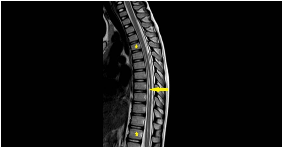
Figure (5): Sagittal T2 MRI sequence at 1 year of follow-up showing a mild increase in the transverse diameter of the syringomyelia (yellow arrow) extending from T4 to T12 (stars).