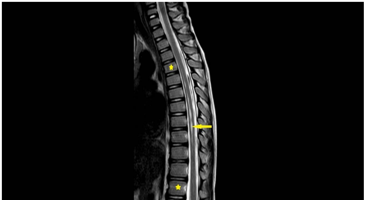
Figure (3): First MRI spine, sagittal T2 sequence showing syringomyelia of 2.7 mm in AP diameter (yellow arrow) extending from T4 to T12 (stars).